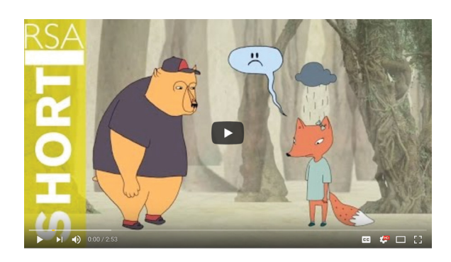
Click to watch

Many have found the following 3 minute video clip from Brené Brown to be a helpful and fun explanation of empathy in real-life terms.